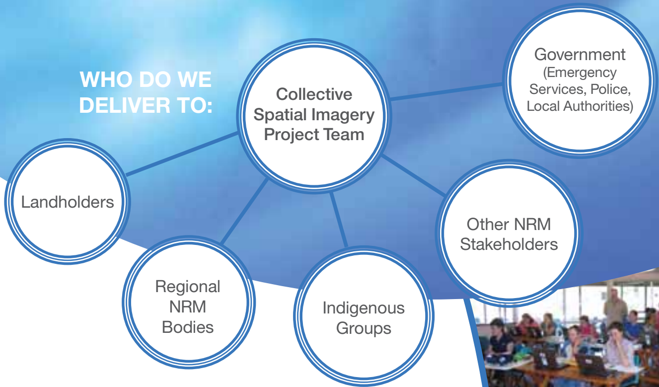
SPATIAL IMAGERY ACQUISITION PROJECT GIS and GPS Training Delivery