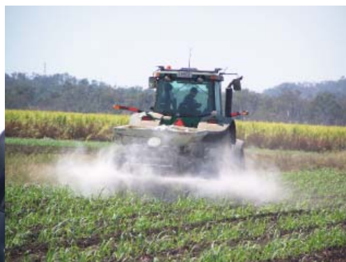
Above and at top: tractor installed with GPS farm mapping on the Blackburn sugarcane farm, Mackay