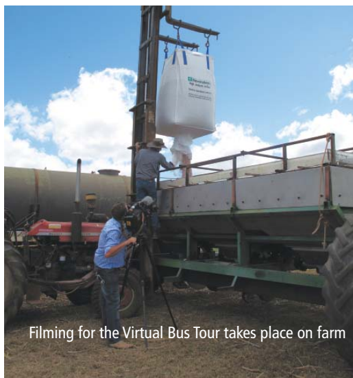
Filming for the Virtual Bus Tour takes place on farm

Contact Suzi Moore, CANEGROWERS 07 3864 6444