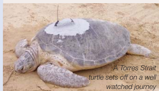
A Torres Strait turtle sets off on a well watched journey

This involvement of young indigenous people through mapping, recording cultural history, and understanding the diverse nature of their region and the importance of protecting it, is helping ensure that indigenous culture will continue through future generations.