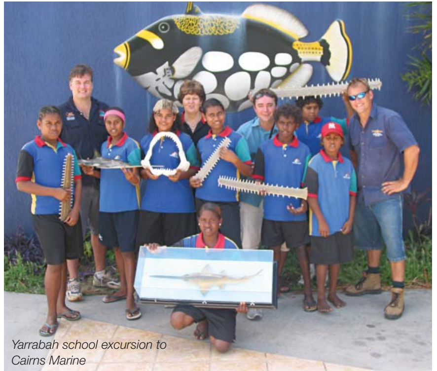
Yarrabah school excursion to Cairns Marine